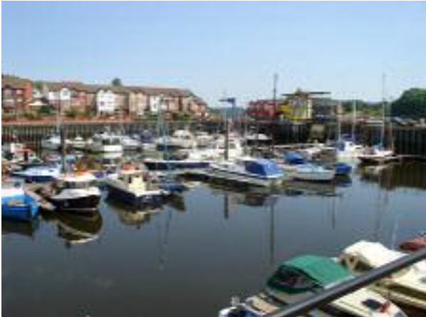
View of the Marina from the Office

The office which provides an area of 133 m 2 (1,432 ft 2 ) is finished to a high standard with suspended ceiling, independent heating, double glazing and is carpeted throughout. The offices have been refitted to provide a number of offices and meeting rooms with the benefit of a fully fitted kitchen and well appointed WC's, although these can be easily removed if required. An excellent property which would provide superb regional Head Quarters. Viewing is highly recommended.